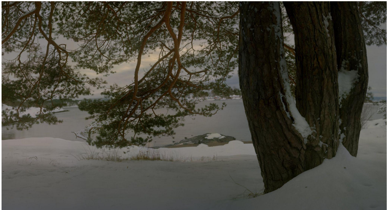
Mikkel McAlinden, Hovedoya , 2022, inkjet print.

Persons Projects (Berlin) are showing a selection of artists from the Helsinki school whose varied perspectives on how to depict nature and landscape reveal photography's potential as a conceptual tool for thinking. Crane Kalman Brighton and Eleven Fine Art (Twickenham) are teaming up to showcase the works of three female photographers whose approaches to landscape photography varies from real, to imagined and fantastical; while at Alessia Paladini (Milan) the group presentation 'On Landscape' will feature works by five women photographers from across the world whose works are connected through the red threads of memory, recollection of the past, change and resilience. The relationship between landscape and memory is also a feature of Los Angeles-based artist Jessie Chaney's evocative images of abandoned civilisation from her series 'Memories of a Space' on show at FabriK Media (Los Angeles); while Bildehalle (Zürich) mounts a group show on the topic of memory and remembering in photography.