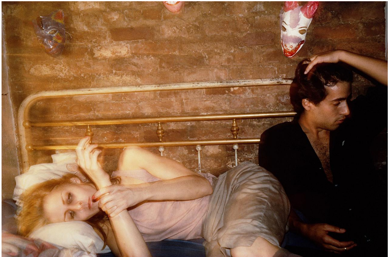
Nan Goldin, "Greer and Robert in bed, NYC", 1982 C-print.

First-time exhibitor Blue Lotus Gallery presents debut exhibition of two important photographers in the UK: works from the 1950s by the Hong Kong master photographer Fan Ho alongside black-and-white prints by the Japanese up-and-coming talent Yasuhiro Ogawa ; while Zen Foto Gallery, also showing for the first time, exhibits Seiji Kurata's seminal "Flash Up" series which depicted Tokyo's nightlife in all its diversity between 1975 and 1978. Meanwhile The Li Yuan-Chia Foundation will exhibit works by Li Yuan-Chia , whose work fused 20th century Western abstract art with Chinese tradition and lived in China, Taiwan, Italy and Britain.