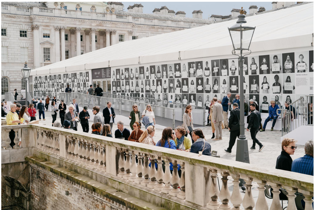
Visitors in front of 'I Matter' pavilion project at Photo London 2023.

Photo London Digital 10 May – 29 May 2023, artsy.net and photolondon.org