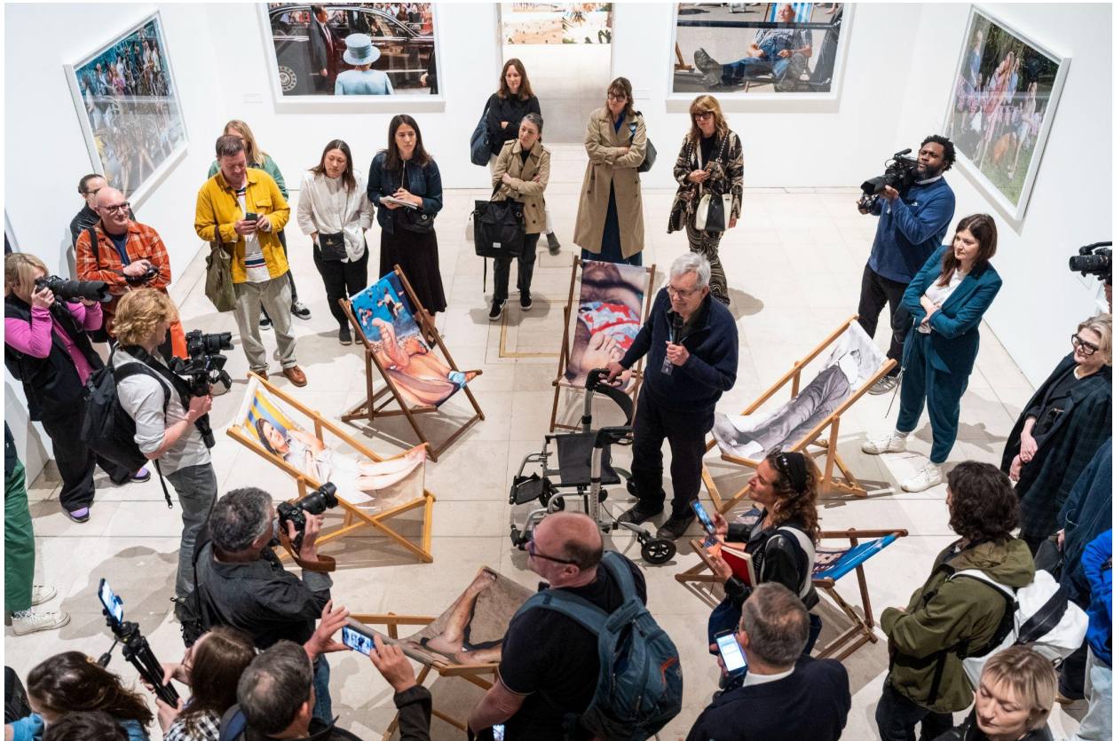
The 2023 Master of Photography, Martin Parr, at the press tour for his exhibition 'Martin Parr. Recent Works'.

Opening just days after the coronation, this year's Public Programme offered a timely celebration of the best of British photography. The legendary Martin Parr reigned supreme, with this year's Master of Photography hailed as 'the Godfather of contemporary British Photography' by fair Founders Benson and Farshad — an accolade much repeated across widespread media coverage.