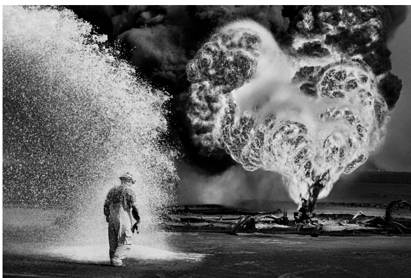
Portrait of Sebastião Salgado, 2019. Kuwait, 1991.

The World Photography Organisation is delighted to announce the acclaimed Brazilian photographer Sebastião Salgado as the Outstanding Contribution to Photography recipient of the Sony World Photography Awards 2024. One of the most accomplished and globally celebrated photographers working today, Sebastião Salgado has achieved international renown for his remarkable black-and-white compositions captured over a career spanning more than 50 years.