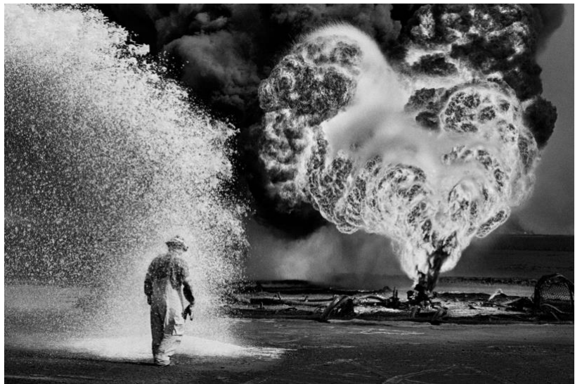
Portrait of Sebastião Salgado, 2019. Kuwait, 1991.

The World Photography Organisation is delighted to announce the acclaimed Brazilian photographer Sebastião Salgado as the Outstanding Contribution to Photography recipient of the Sony World Photography Awards 2024. One of the most accomplished and globally celebrated photographers working today, Sebastião Salgado has achieved international renown for his remarkable black-and-white compositions captured over a career spanning more than 50 years.